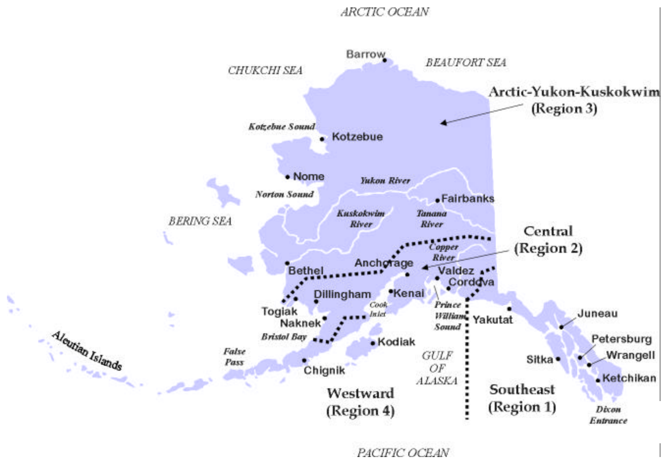
Figure 2. The four fishery management regions (Southeast, Central, Arctic-Yukon-Kuskokwim, and Westward) of the Alaska Department of Fish and Game, Division of Commercial Fisheries.