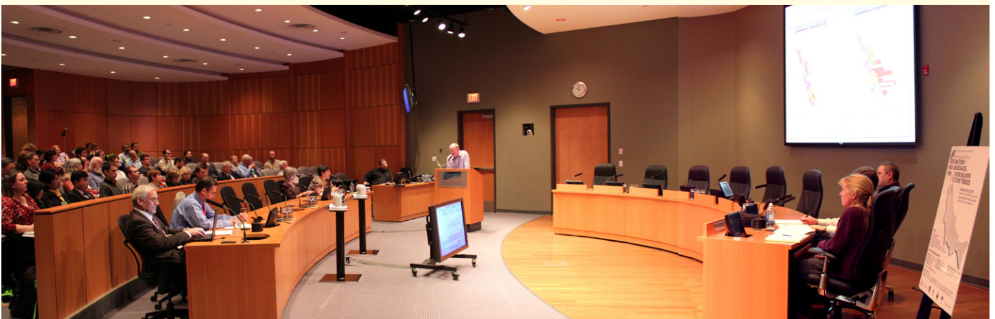
Oral presentation at the Workshop